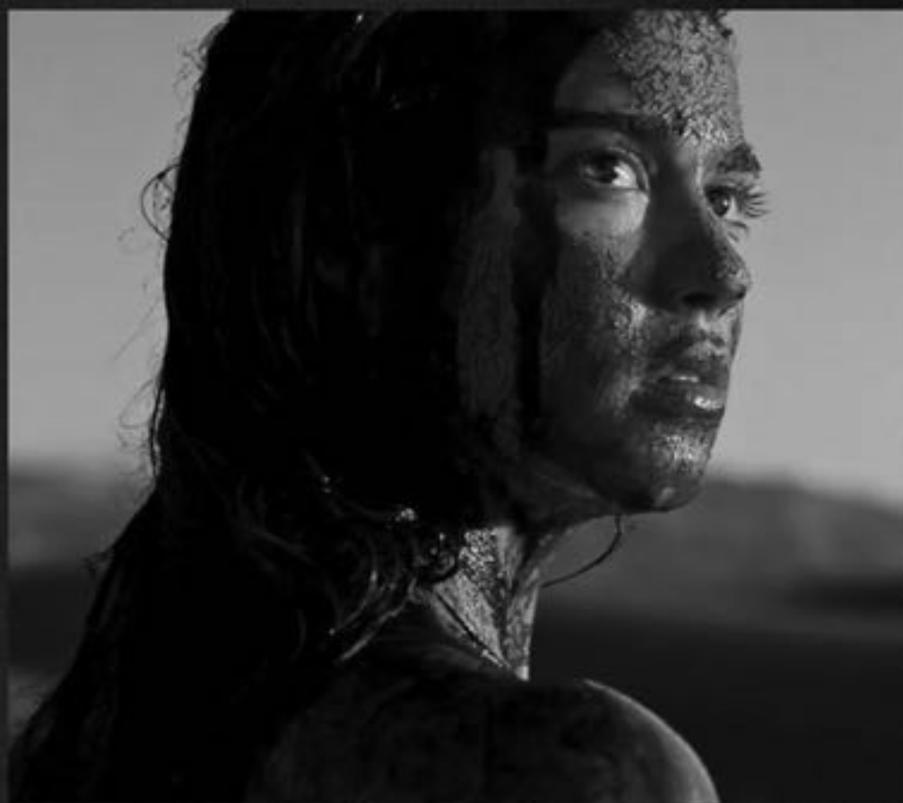
STRONG FEMALE LEAD