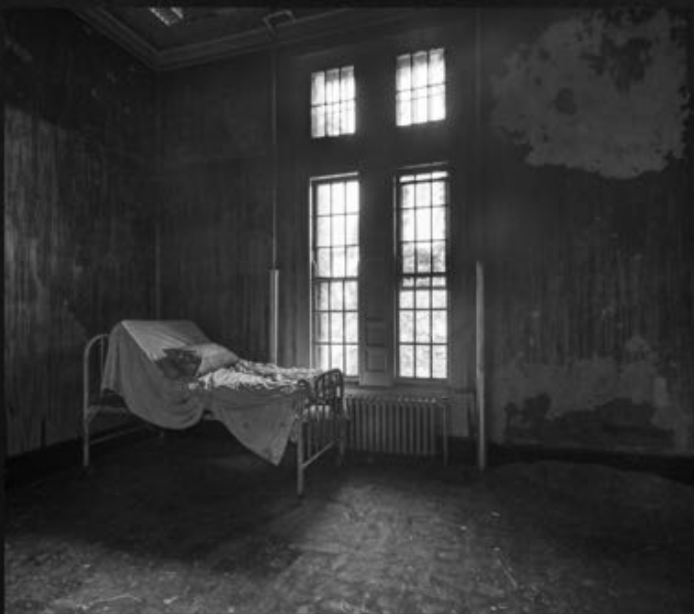
MINIMAL LOCATIONS & CAST

Minimal locations, minimal cast, STRONG FEMALE LEAD, potential for franchise with the Bern character.